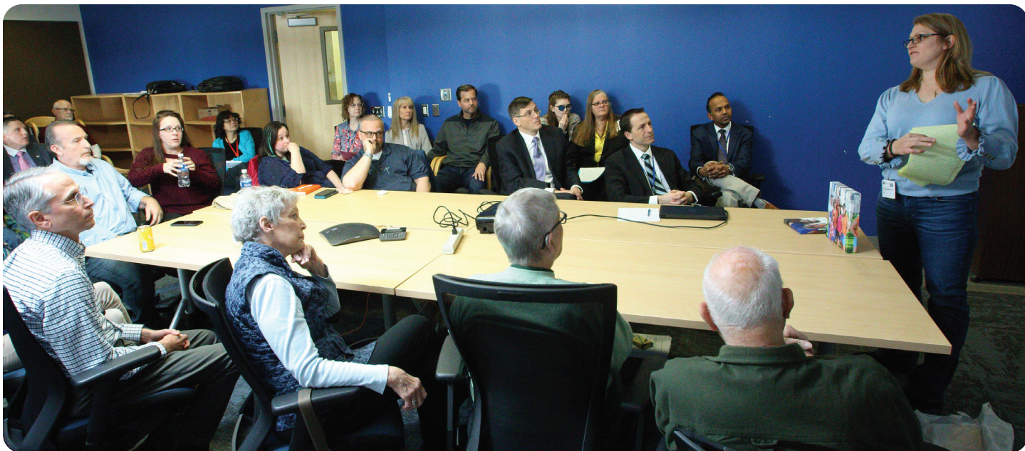
Participants in the first annual Olfactory Neuroblastoma Patient Education Event, held in February 2020.