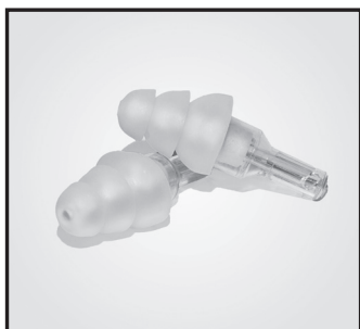
Pre-molded, high-fidelity earplugs